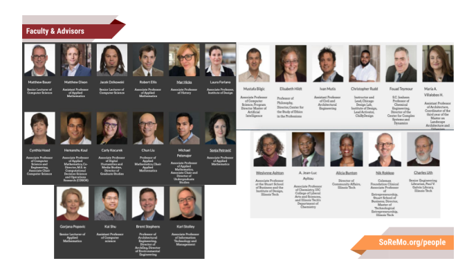
Figure 4: A snapshot of the core SoReMo Faculty & Advisors at the end of Spring 2021

Our team is ever evolving and welcoming new contributors. We gratefully acknowledge everyone who has taken part in the Spring 2021 SoReMo Forum in any form, all the faculty and advisers and external collaborators who have helped the Fellows in a variety of ways in completing their projects. We grow as we learn, and we learn as we grow!