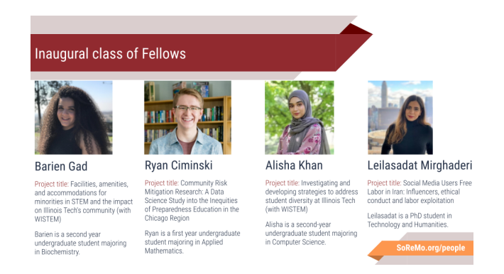
Figure 3: A snapshot of the announcement of the inaugural class of Fellows