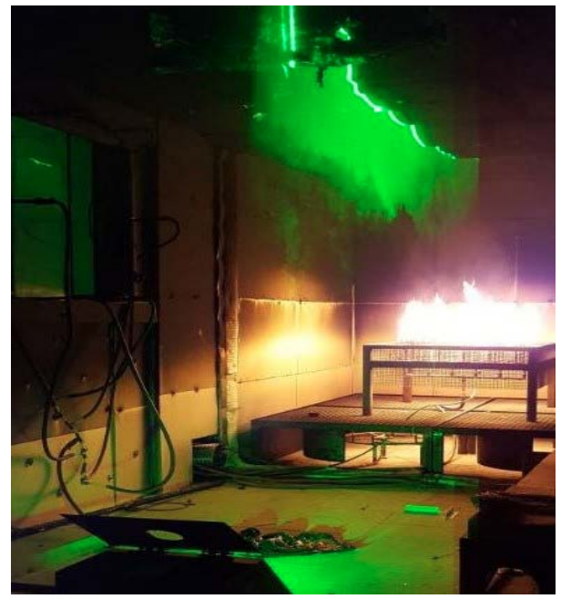
Fig. 1 : Laser and particle image

An experimental test bench is set-up to investigate the smoke dynamics characteristics of enclosure fires. Two maritime containers, one for the test cell, one for the measure and control cell are mounted perpendicularly. The standard size of a maritime container is 6m\times2.59m\times2.45m . These structures have emerged as training tools in rescue services. The volume of these containers is close to that of a room of a standard flat, which is approximately 35m^3 . In the configuration, only one outlet (opposite to the fire) of 1m^2 , is open. The fuel source consists of 36 propane burners with a surface area of 1m^2 . Fire can reach 1MW with temperatures inside the container of 1000^\circ C.